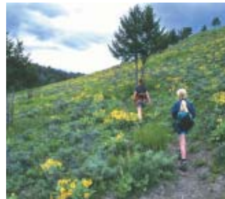
Diverse rangelands accommodate multiple uses including livestock grazing, wildlife habitat, and recreation.