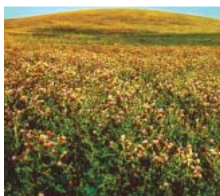
Disturbances including fire, erosion, and the establishment of invasive plants impact rangeland sustainability.